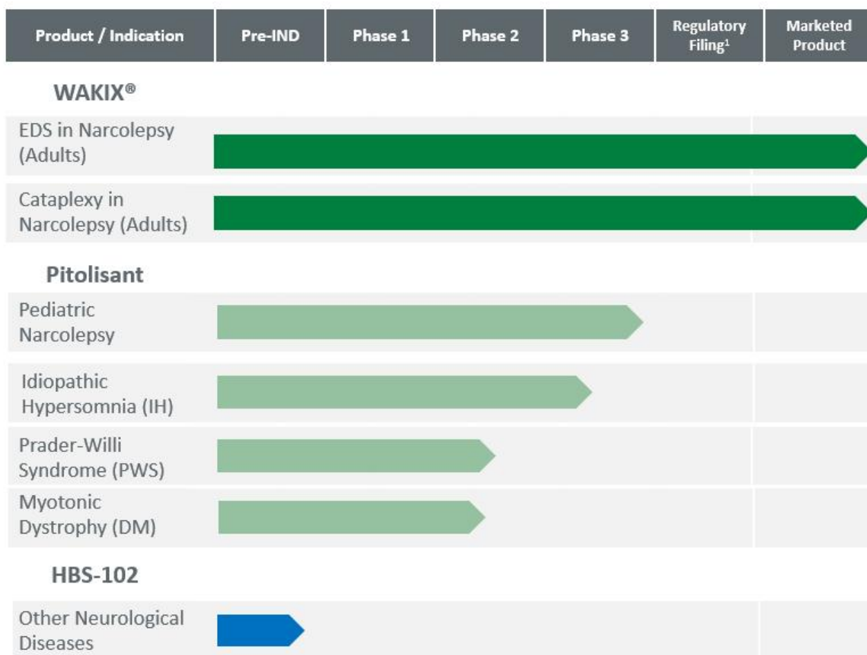
Development Pipeline Chart